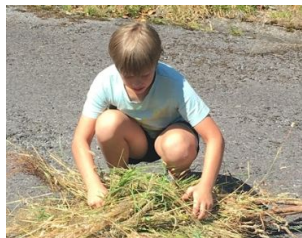
Room 6 went to Konini Lodge this week.

Room 13 and their older role models from Room 4 enjoyed a visit to Sam’s house. The plums gathered from the visit will be used to make Plum Jam.